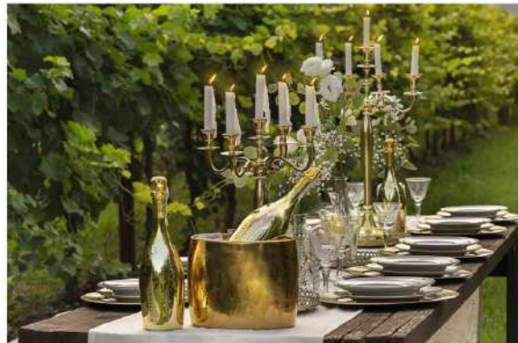
The striking Bottega Gold is the best-selling Prosecco in Duty Free according to IWSR Report 2022.

The new range is the result of a project that began more than 10 years ago. By extending the fermentation time, winemakers are producing Prosecco with increased complexity and even longer ageing potential.