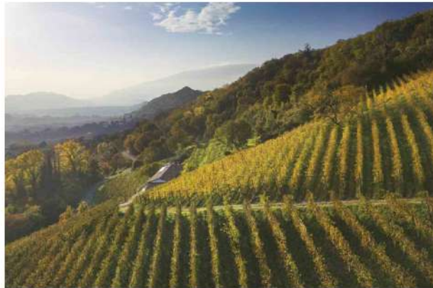
Bottega vineyards sit in the prime quality hilly area of the Treviso province.