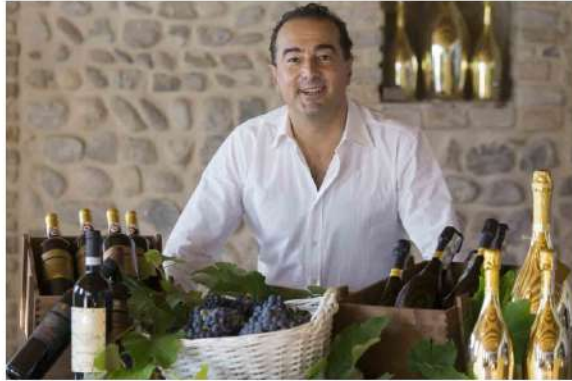
Bottega has spent a decade developing its Gold Premium Vintage Collection range.

Once picked, the grapes undergo an extended fermentation, ranging from four up to 12 months depending on the wine (well beyond the standard three months), inside horizontal autoclaves, allowing the wines to develop a greater depth of complex aromas and flavours. It's in these sophisticated pressure chambers that a second fermentation takes place using the Martinotti method, which allows the wine to develop its distinctive bubbles.